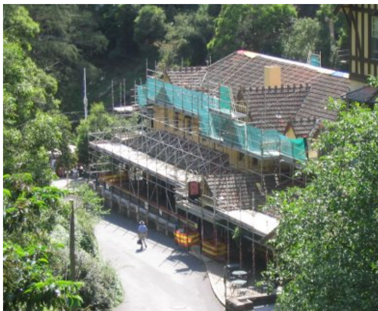
Caves House under scaffolding.

The roofing work is a major exercise, just have a look at the slope of the roof these guys have to work on. The roofing and repainting is costing $1.4million and the work is expected to be finalised in the next few months.