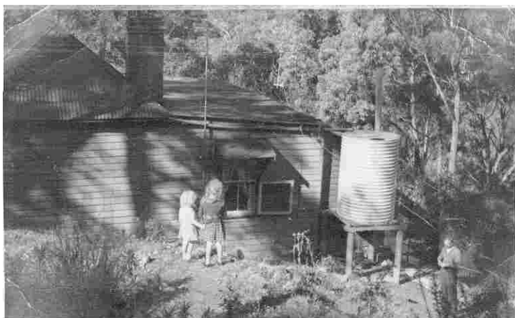
In the yard 1949.