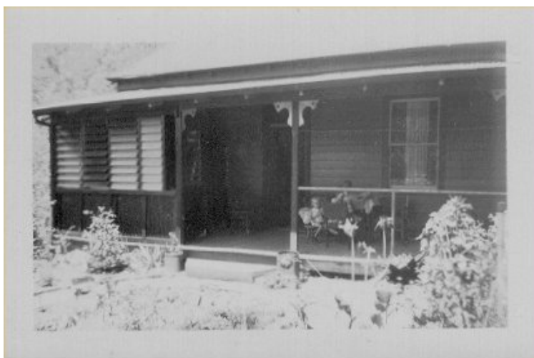
The Giles house in 1949.

Snakes would enter the house if milk had been left for animals. Mum would kill them with an axe and line them up on the wire netting for Dad to see. NB Snakes weren't protected in those days. Groceries, alcohol, clothing came once a month from David Jones on the pioneer bus. Powered milk, tinned fish, haddock, tasty & blue cheeses lots of crackers and Saos. Mum made icecream in her refrigerator, cooked sponge cakes and sewed our dresses on the treadle sewing machine.