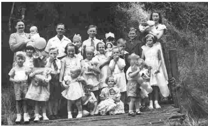
The 1950 Christmas party.